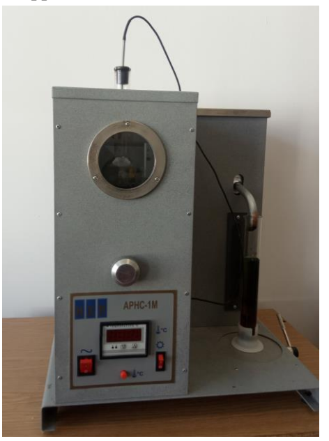
Fig. 1. Apparatus for frictional distillation of fuel

To understand the course of evaporation and mixture formation, during the combustion of diesel fuel and biodiesel, the fractional composition of the fuel was determined according to the distillation temperature. According to the distillation temperature indicators one can distinguish the presence of heavy fuel fractions, which worsen mixture formation, induce the formation of carbon deposits and increase smoke. Measurements of the fractional composition according to the distillation temperature were carried out on an ARNS-1M apparatus.